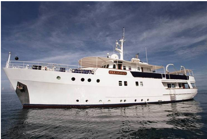
Photo and video: Our photo and video center features a digital image editing studio. Clean fresh water is available for cameras. The dive support staff will look after your camera and video equipment as if it were their first born.

Sustainable Diving: From day one, Wakatobi Dive Resort lived the belief that protecting the reefs was going to be an integral part of running a sustainable dive operation. We felt so strongly about this, we started the Wakatobi Collaborative Reef Conservation Program, a privately-funded reef conservation, education, and community improvement program. This unique program is designed to align the interests of