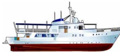
Upper Deck: Wheelhouse, Captain's & First Mate's cabins, chart room and sundeck.

Getting There: For Wakatobi region cruises, you can simply book your flight into the convenient international hub of Bali and Wakatobi's private air service will fly you right to the Pelagian's port—at no additional charge. We've eliminated the last-minute rushes, long check-in lines and excess baggage charges—a convenience that no other liveboard operator offers. Instead of treating you just like another diver, the Pelagian treats you like a welcome guest!